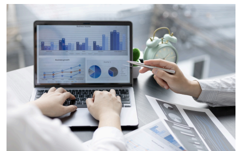
Real-time display of critical parameters and setting of alarm levels